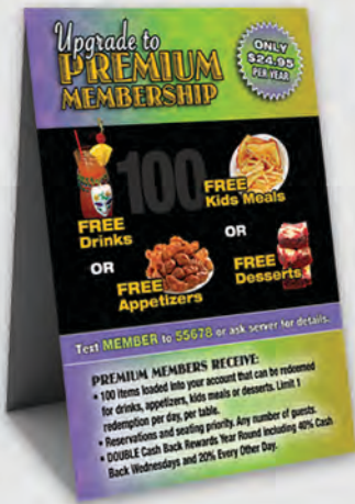
TABLE TENTS / FLOOR DISPLAYS

Set up an attention-grabbing floor display or table talker illustrating the benefits of membership. Customers can whip out their phone while standing in line or hanging out at a table and text a simple keyword to one of our short codes to kick off the membership purchase. Customers can review the full list of membership benefits and check out right from their phone over our secured payment form.