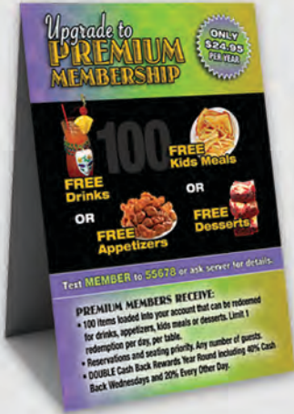
TABLE TENTS / FLOOR DISPLAYS

Set up an attention-grabbing floor display or table talker illustrating the benefits of membership. Customers can whip out their phone while standing in line or hanging out at a table and text a simple keyword to one of our short codes to kick off the membership purchase. Customers can review the full list of membership benefits and check out right from their phone over our secured payment form.